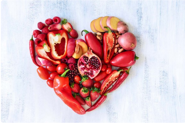
Variety of fruits and Veggies

The Truth initiative is a tool to help teens quit vaping. Click the pink box to bring you to the link.